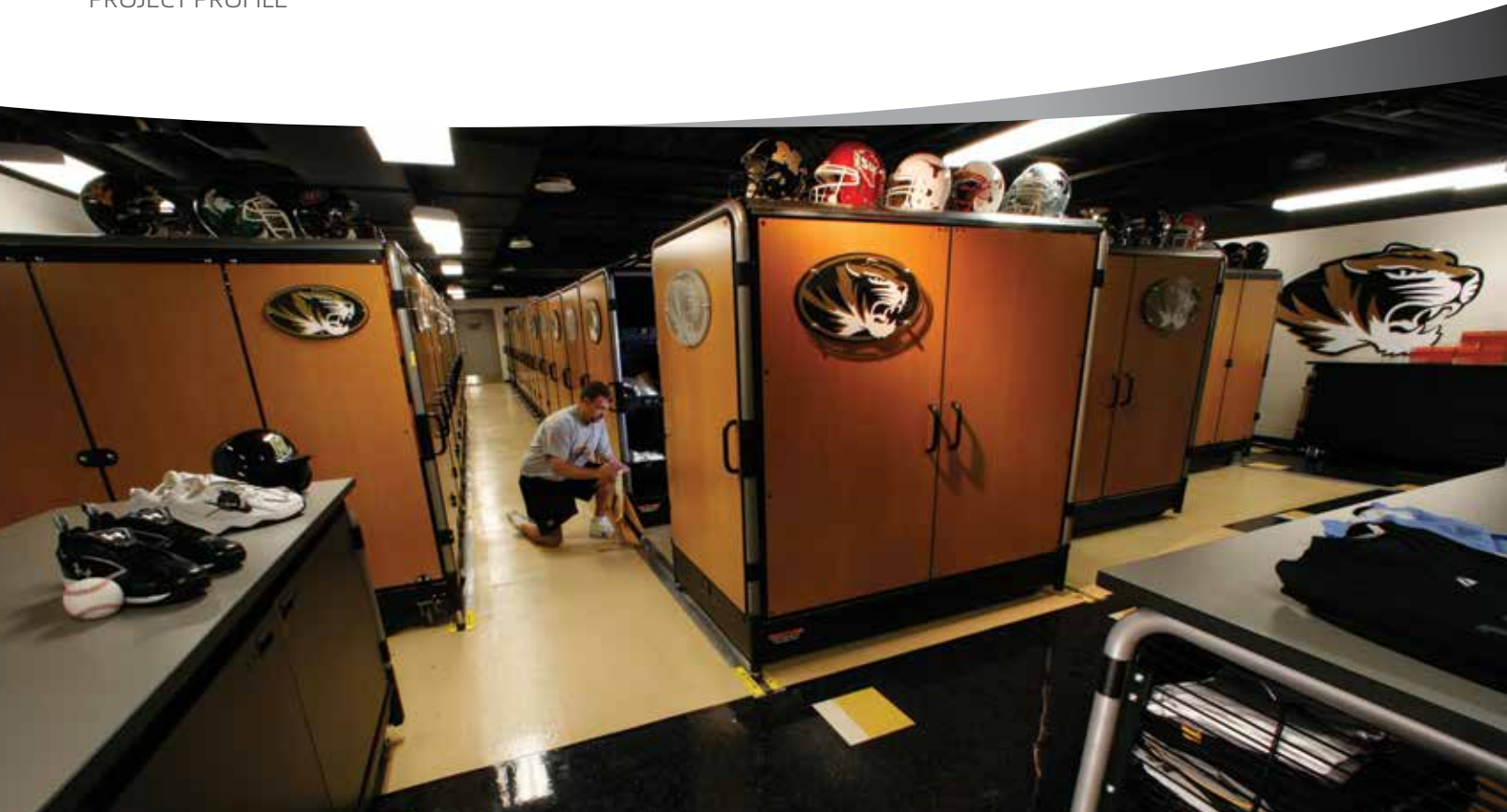
GEARBOSS X-CART™, TEAM CARTS™ AND WORKSTATIONS

“Seasons change, times change, weather changes and the GearBoss System gives me the flexibility I need,”